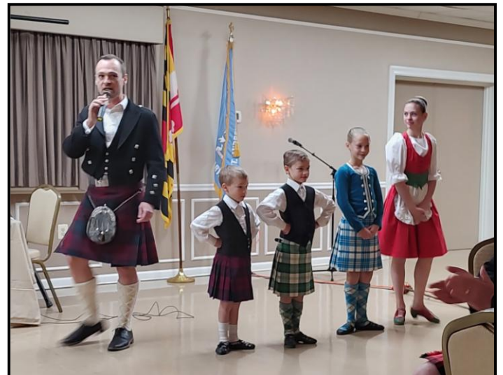
Crawford Family * Highland Folk Dancing