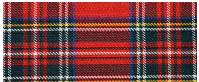
St. Andrew's Tartan